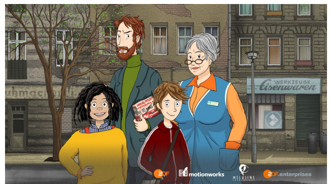
In the Labyrinth of Lies