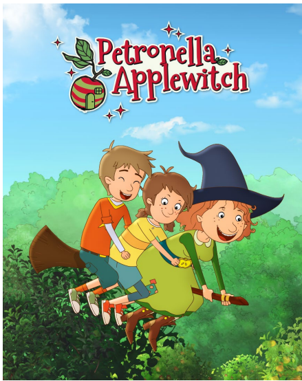
Petronella Applewitch

26 September, 2019 - Animation Germany hosted an event focusing on German-European co-productions at the Cartoon Forum in Toulouse, the largest European pitching market for animation series. Animation from Germany is the most successful export product of the German film industry and is increasingly being co-produced with European partners.